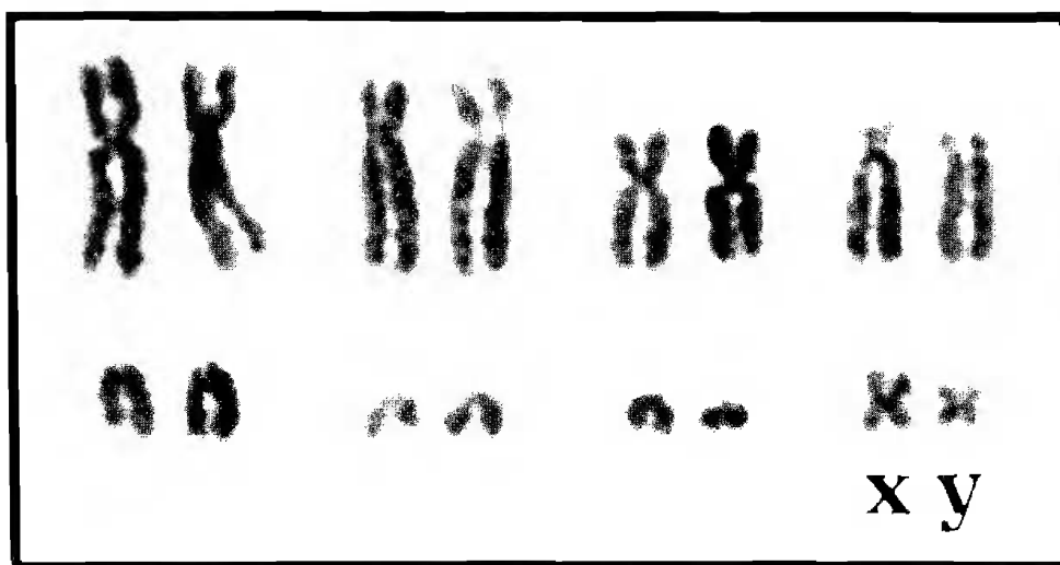
FIG. 1.—Karyotype of a male Musonycteris harrisoni from Jalisco, México.

Hylonycteris (TTU 36152, adult male from 3 km. E Teapa, Grutas de Cocona, Tabasco) is approximately half the size of the X but has extremely reduced arms above the centromere.